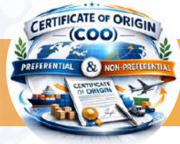
Certificate of Origin (COO) – Preferential & Non-Preferential