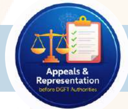
Appeals & Representation before DGFT Authorities