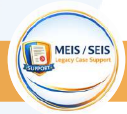
MEIS / SEIS Legacy Case Support